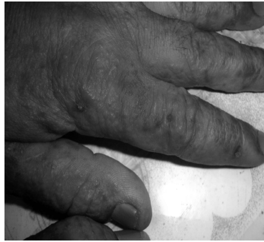
Fig.(2):CD in the hand of car mechanic.